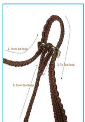
Close-up of slider